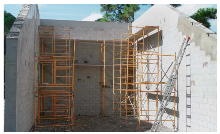
The racquetball court is quickly approaching completion