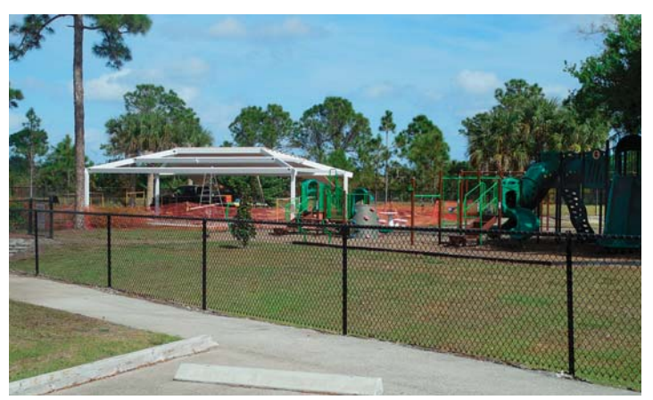
The largest pavilion is being constructed near the playground equipment

The permit was approved and the contractor began construction of the improvements on January 5, 2015.